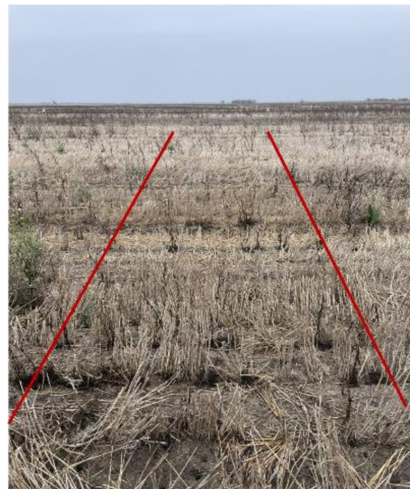
3.75 L Biffo + 100 mL Voraxor + Hasten