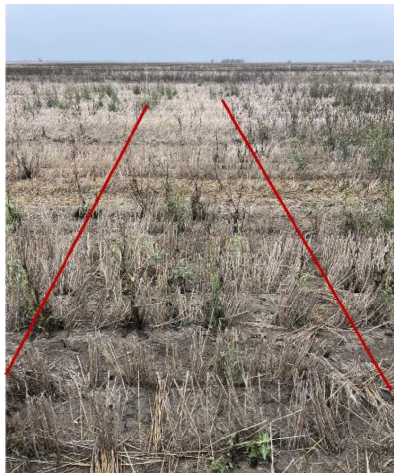
2.3 L Colex D