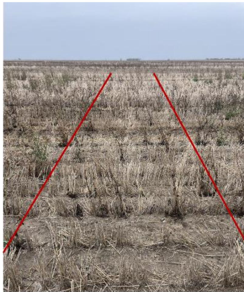
4 L Trooper 75-D