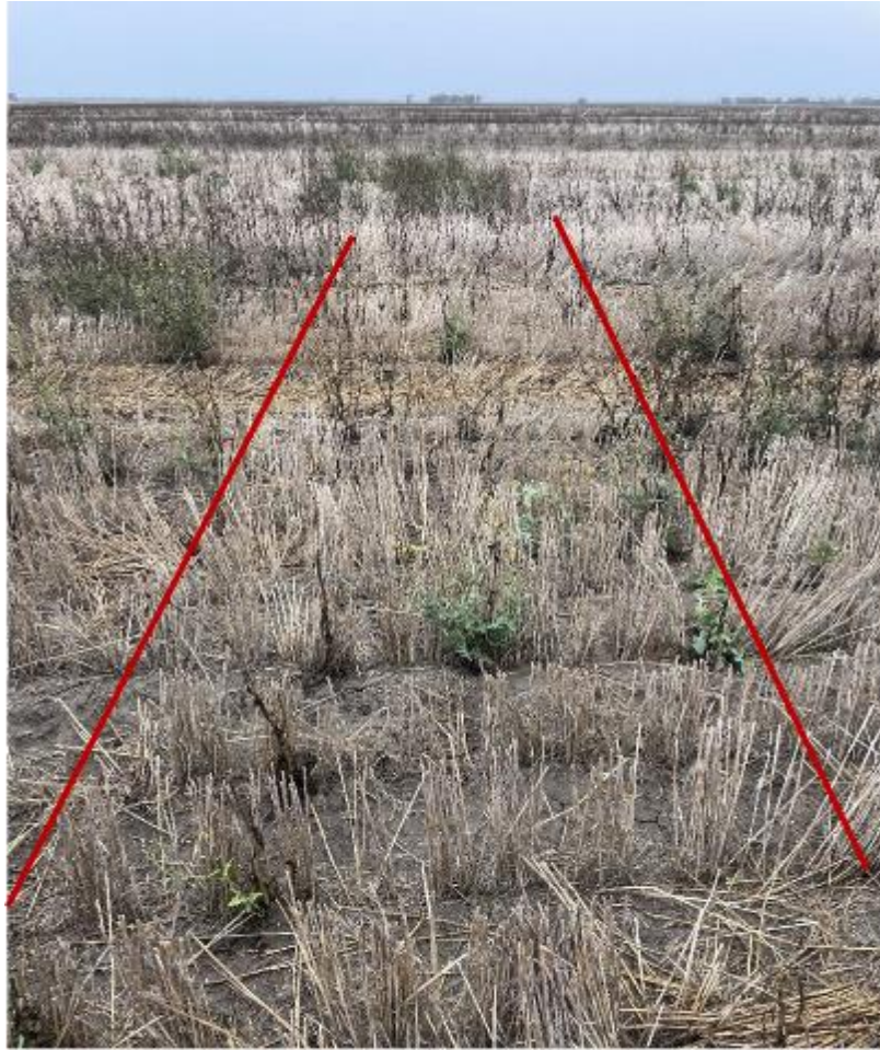
3.75 L Biflo + Hasten (Delta T 11.2)