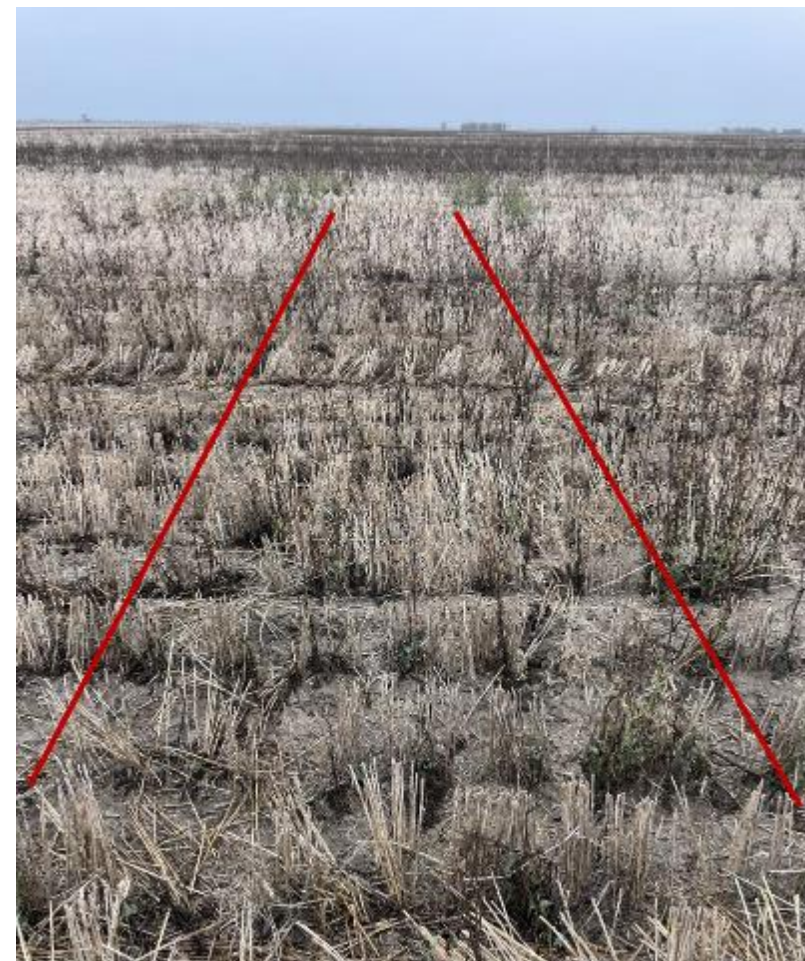
2.1 L Roundup PL (Delta T 6.7)