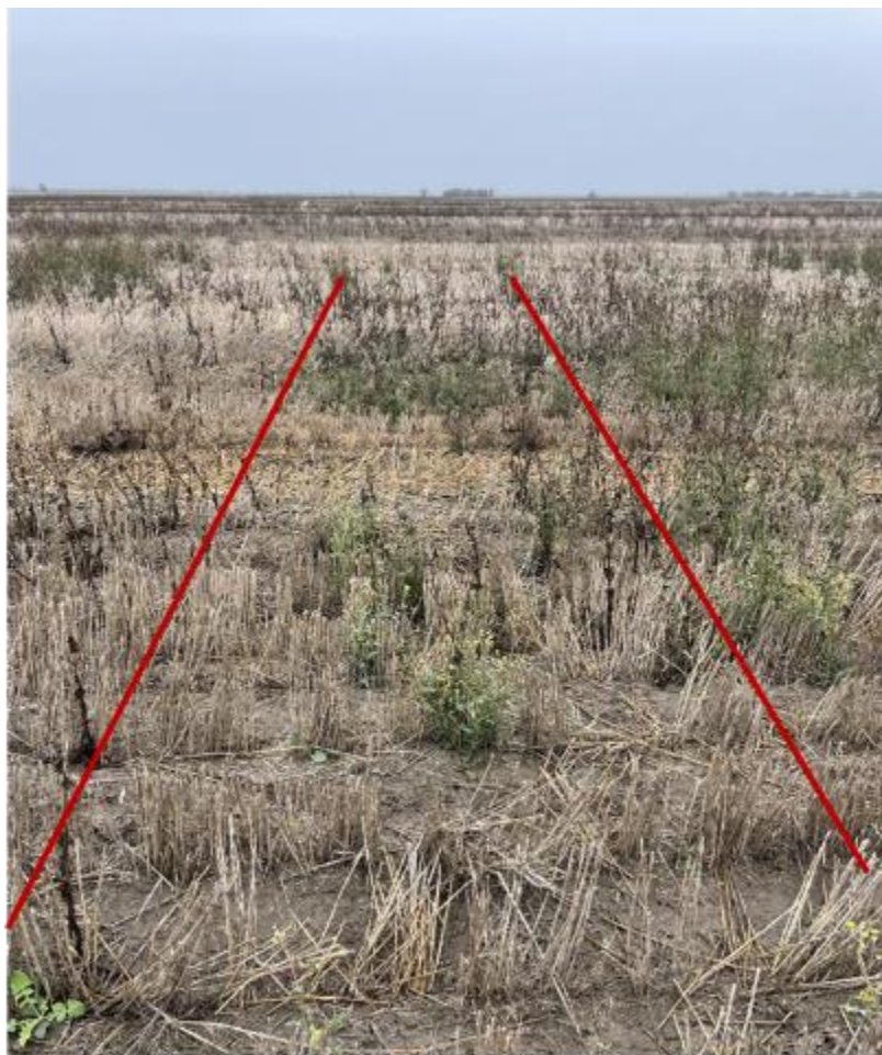
2.5 L Glyphosate 450CT (Delta T 11.2)