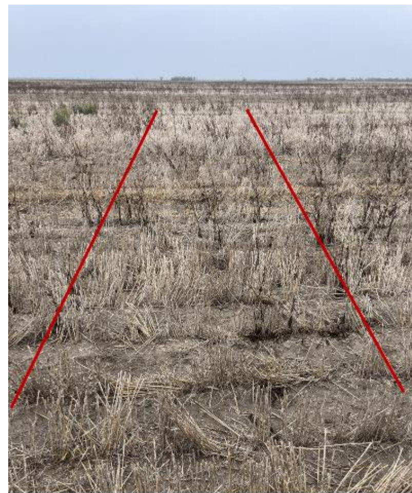
4.17 L Gramoxone 360 + 100 mL Voraxor + Hasten