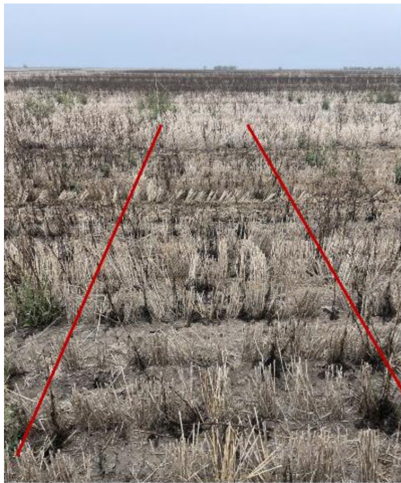
2.1 L Roundup PL + 100 mL Voraxor + Hasten