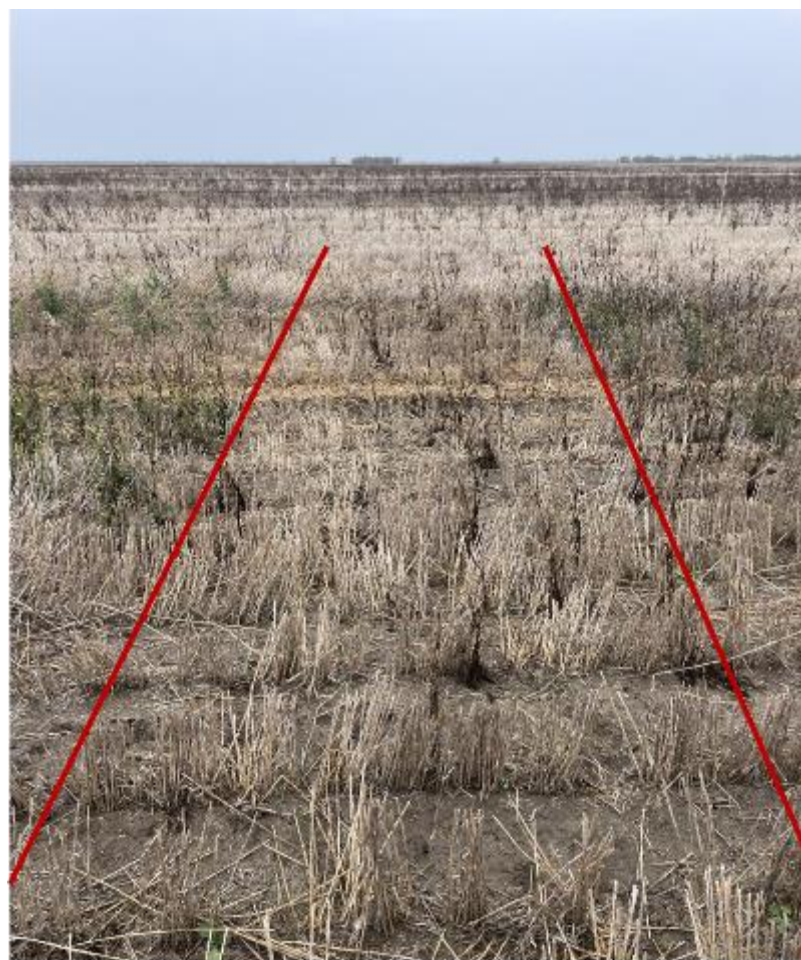
10 L Biffo