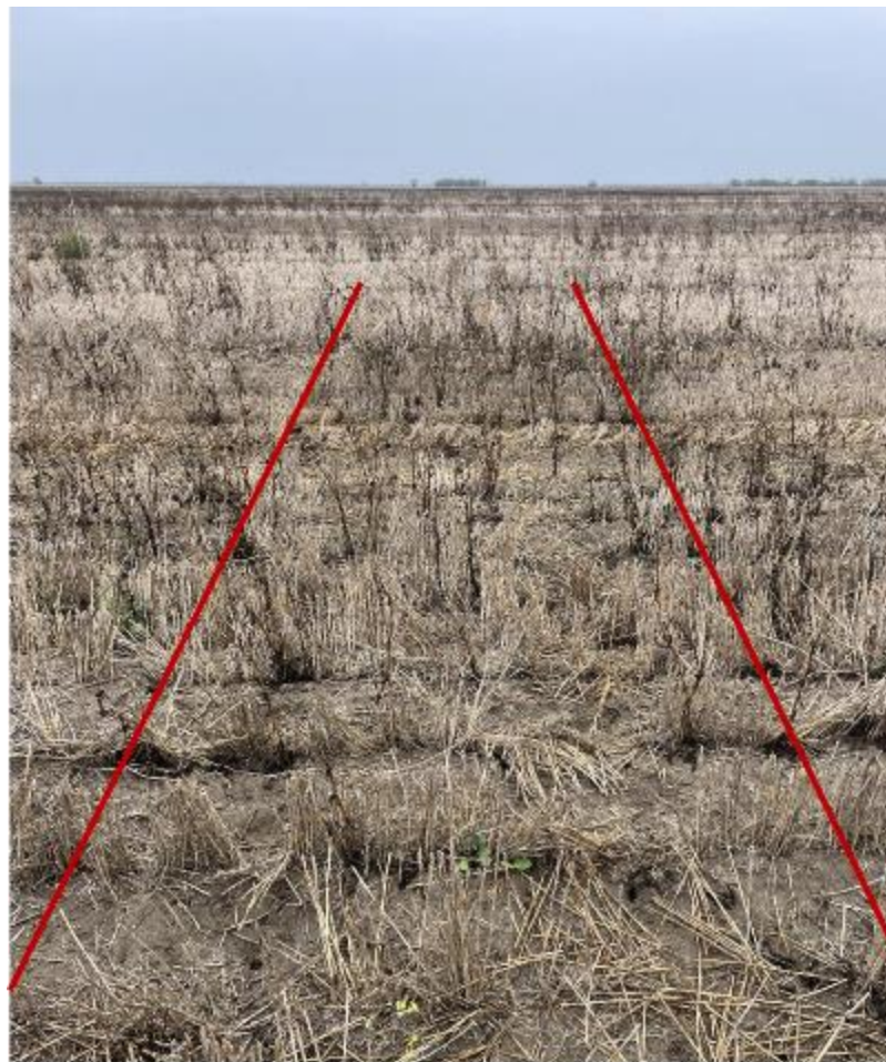
6.7 L Dropzone