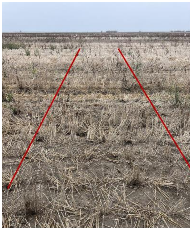
4.17 L Gramoxone 360 + 40g Terrad'or + Hasten