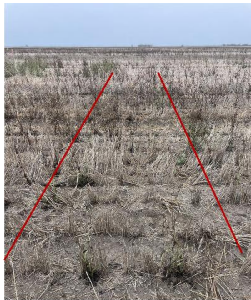
3 L Flagship 400