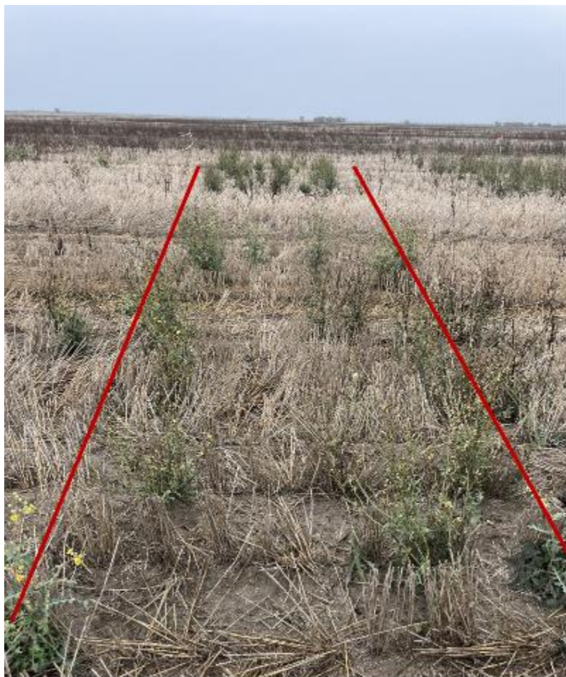
500 mL Flagship 400 + Hasten