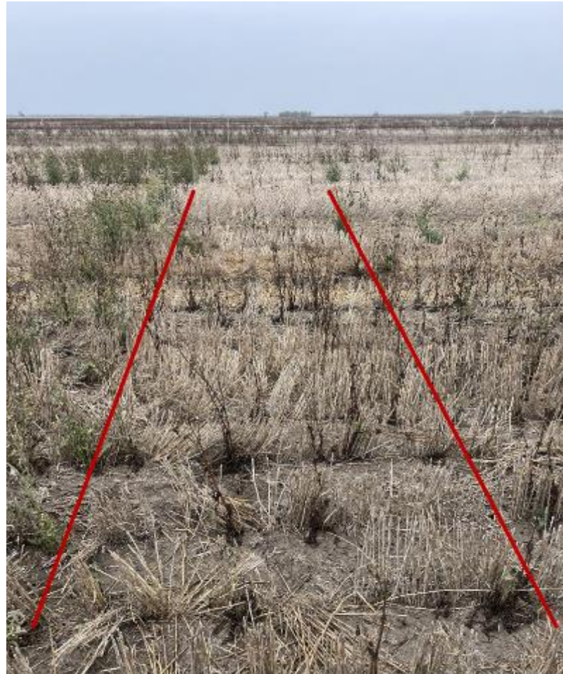
5.5 L Crucial (Delta T 11.2)