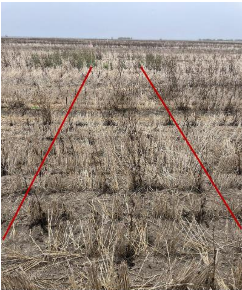
4.9 L Ester 680