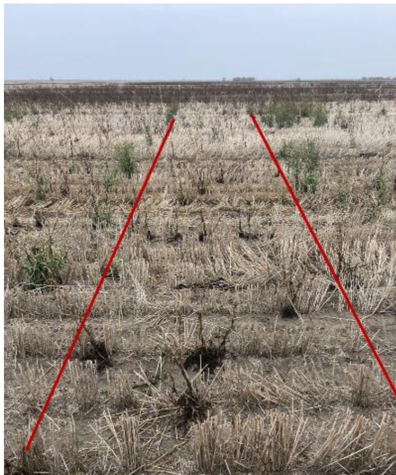
2.1 L Roundup PL + 17g Sharpen + Hasten