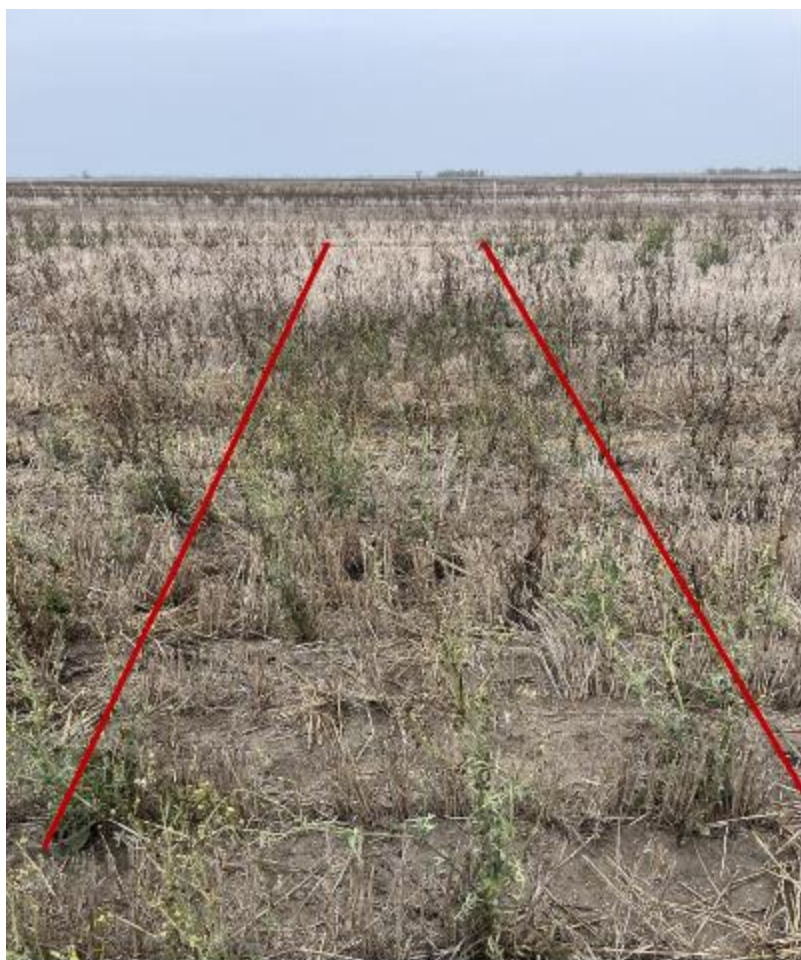
1.5 L Flagship 400