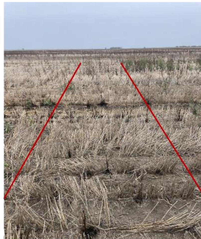
2.75 L Crucial + 100mL Voraxor + Hasten