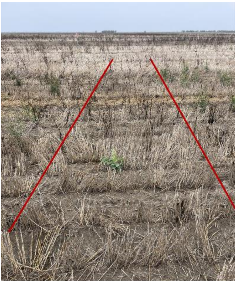
4.17 L Gramoxone 360 + Hasten