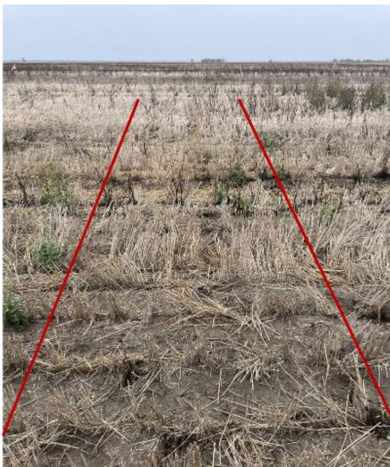
6 L Biffo