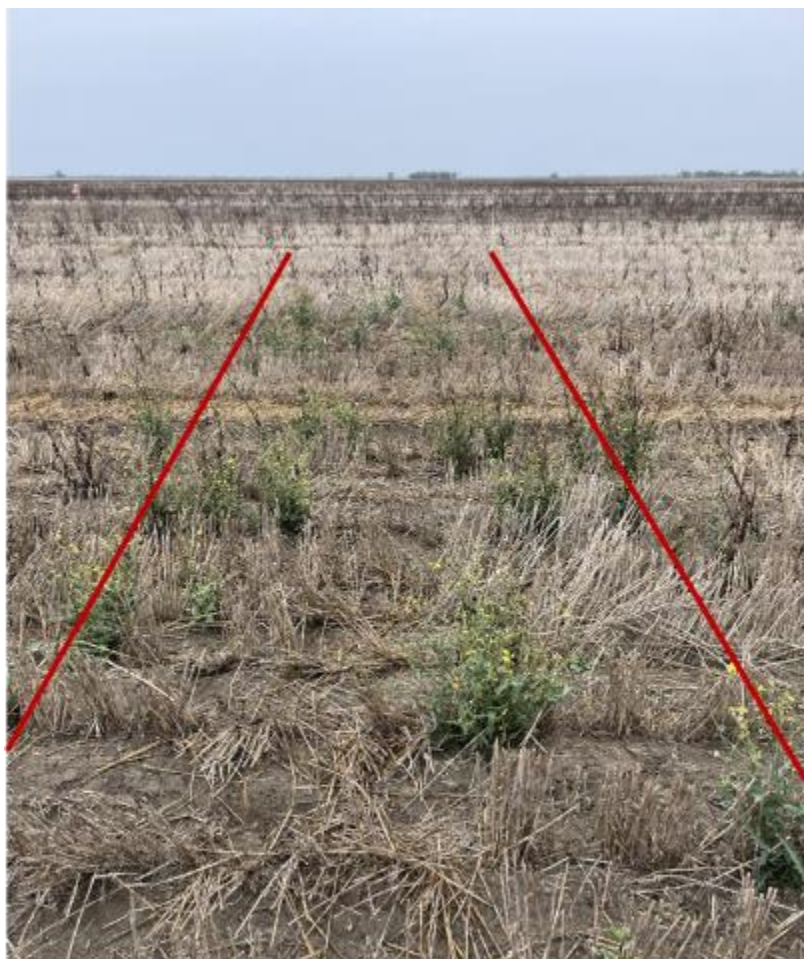
2.75 L Crucial