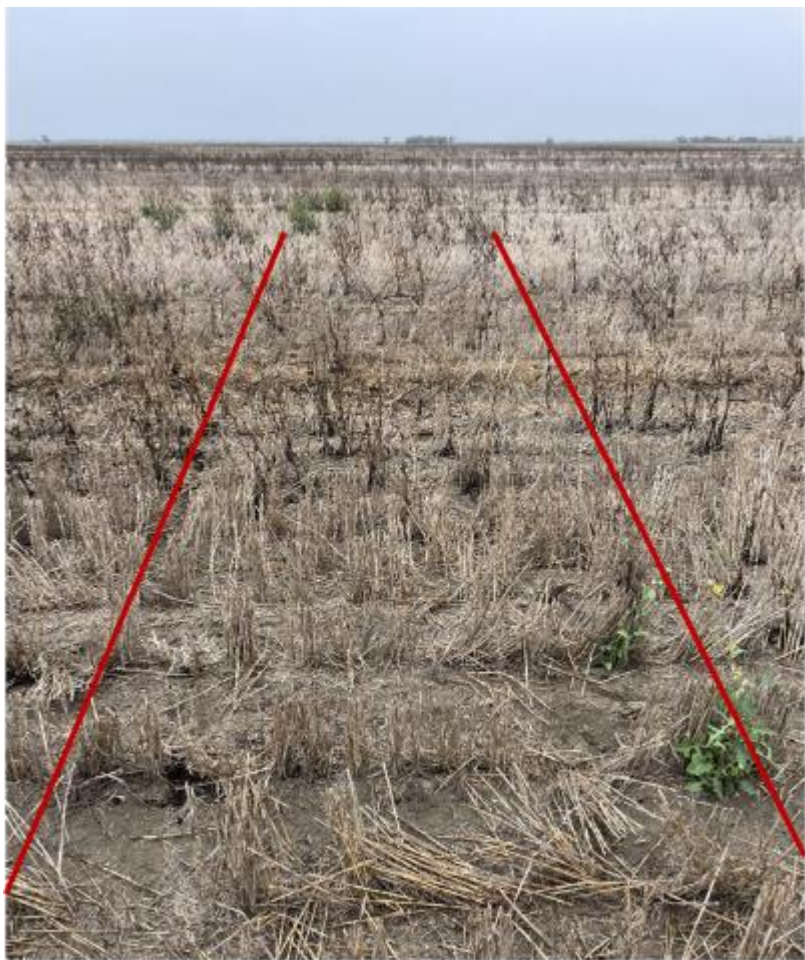
6.16 L Colex D