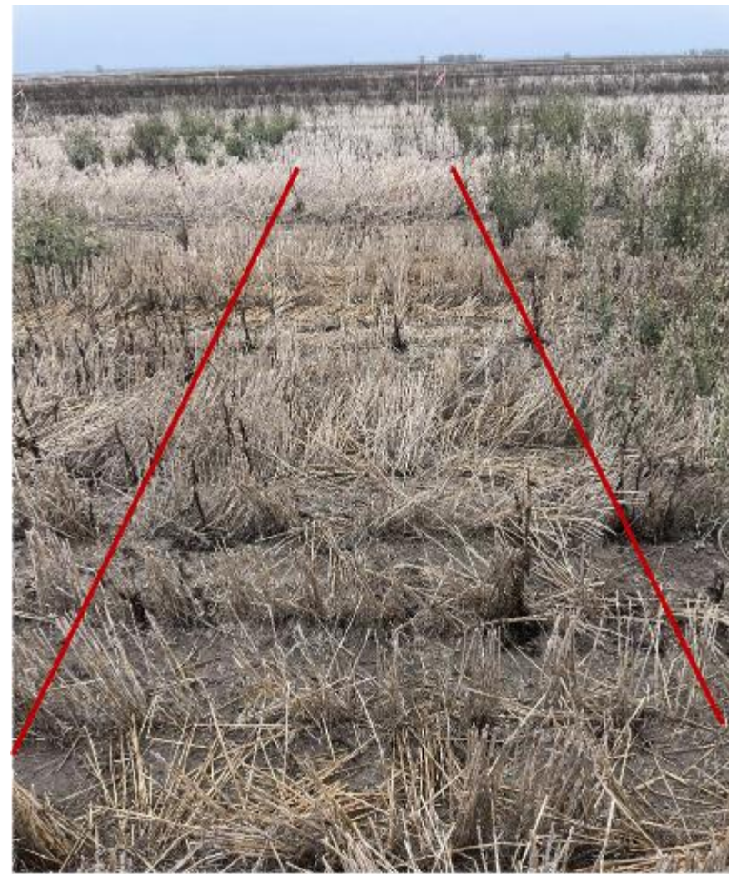
3.75 L Biffo + 100 mL Voraxor + Hasten