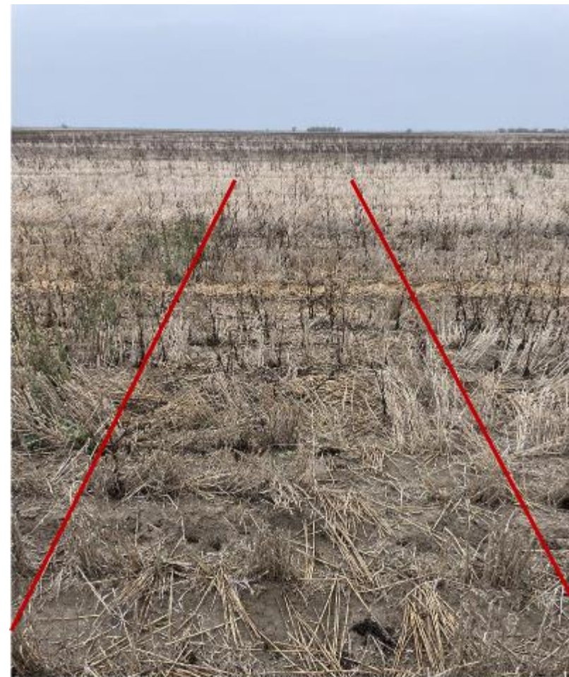
6.25 L Gramoxone 360 + Hasten