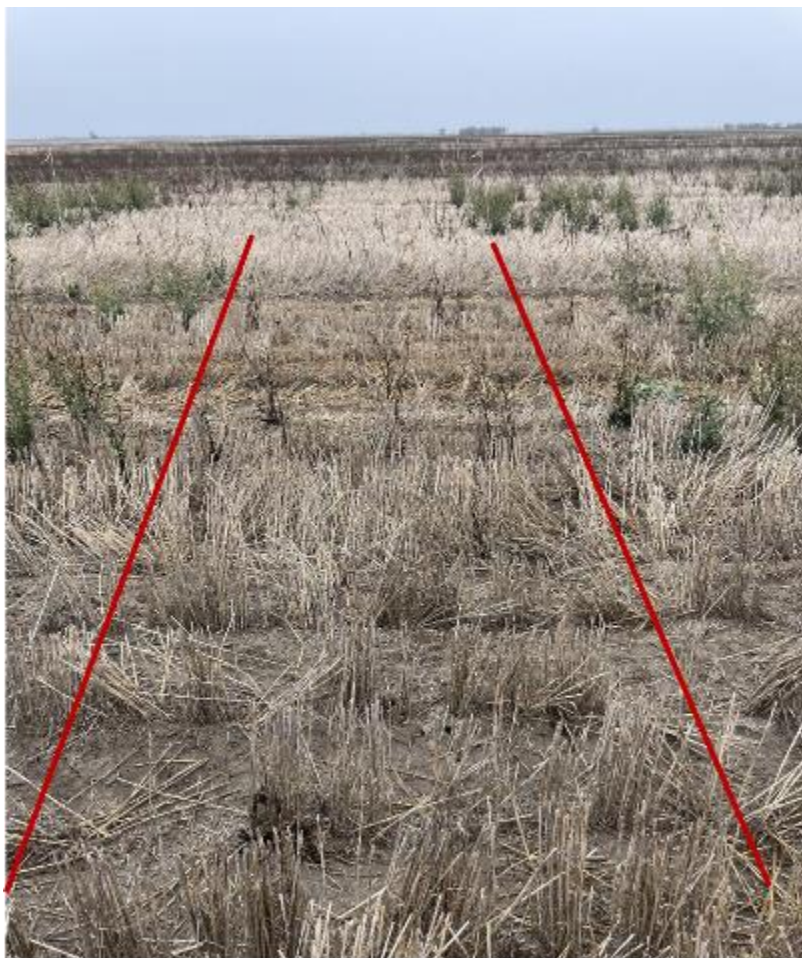
17 g Sharpen + Hasten