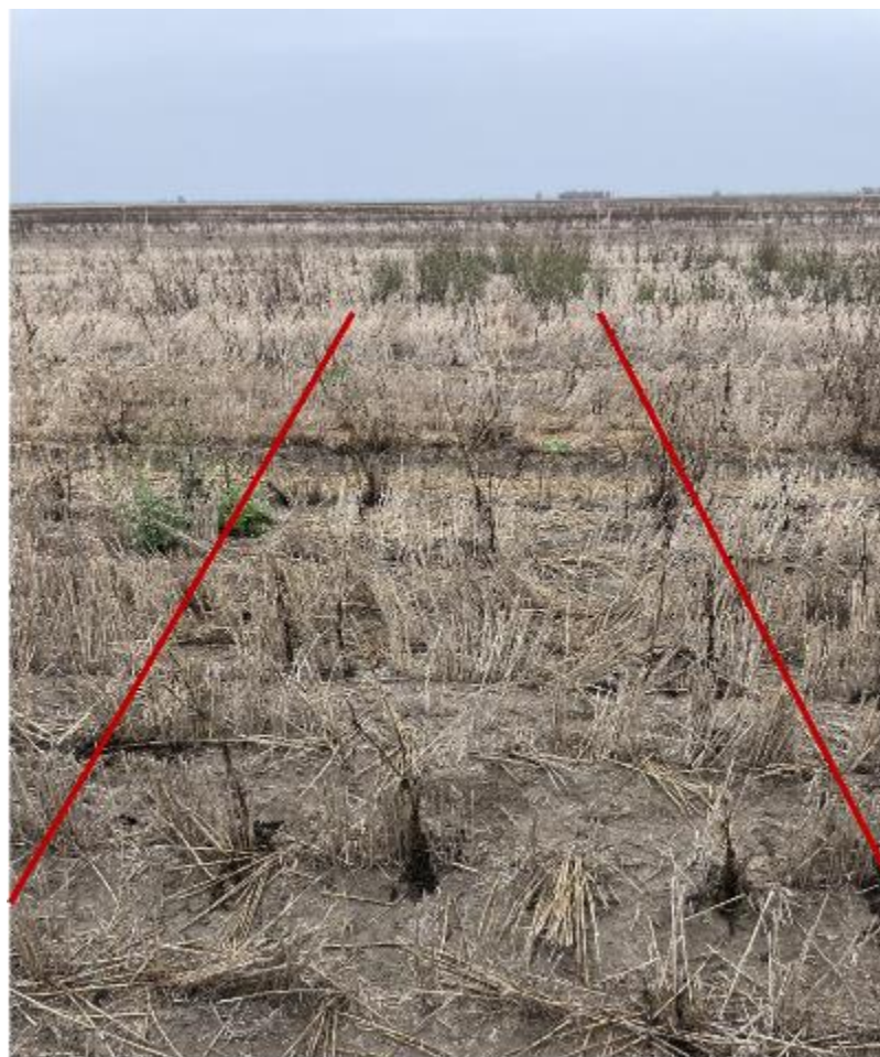
1.8 L Crucial + 40g Terrad'or + Hasten