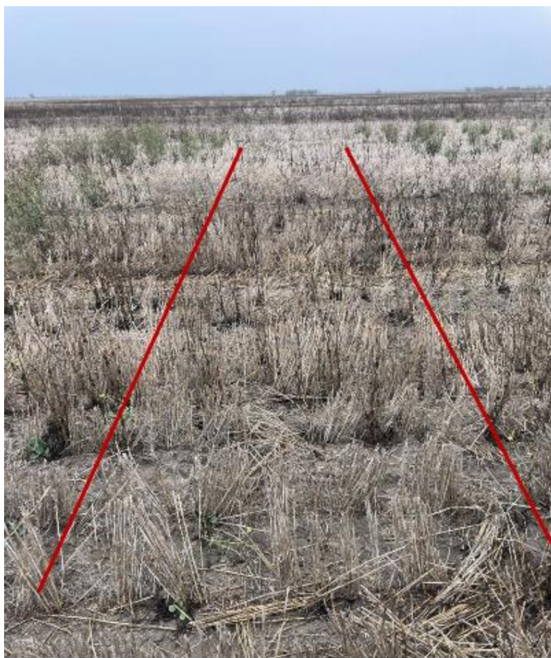
2.1 L Dropzone