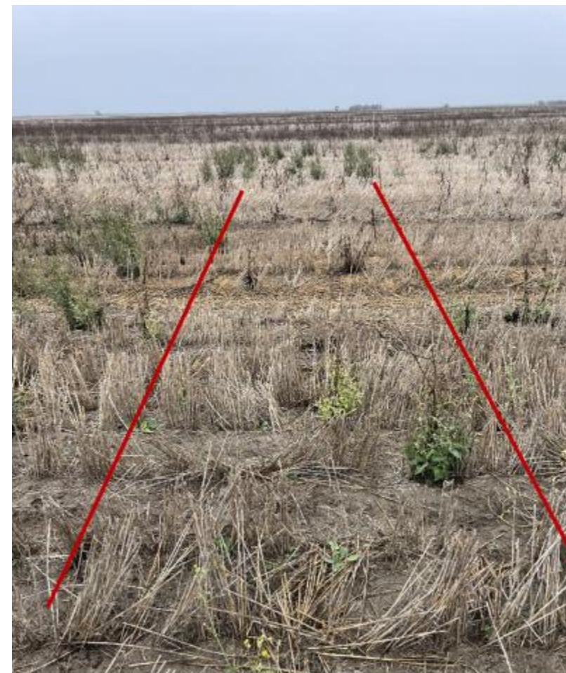
1.8 L Crucial + 40g Terrad'or + Hasten