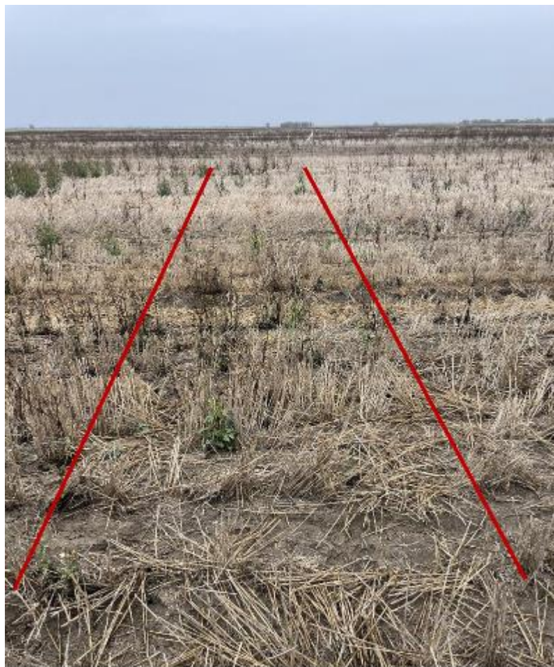
1.3 L Monsoon + Hasten