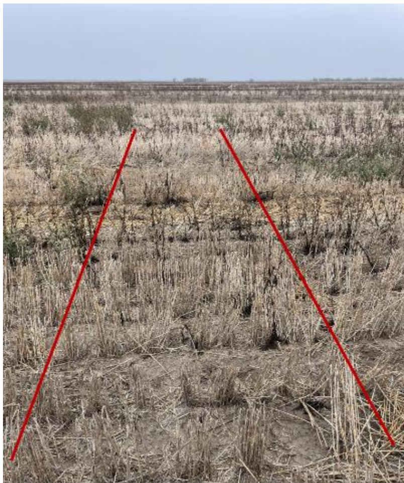
100 mL Voraxor + Hasten