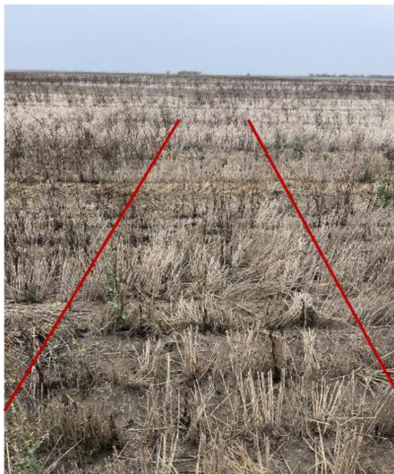
4 L Monsoon