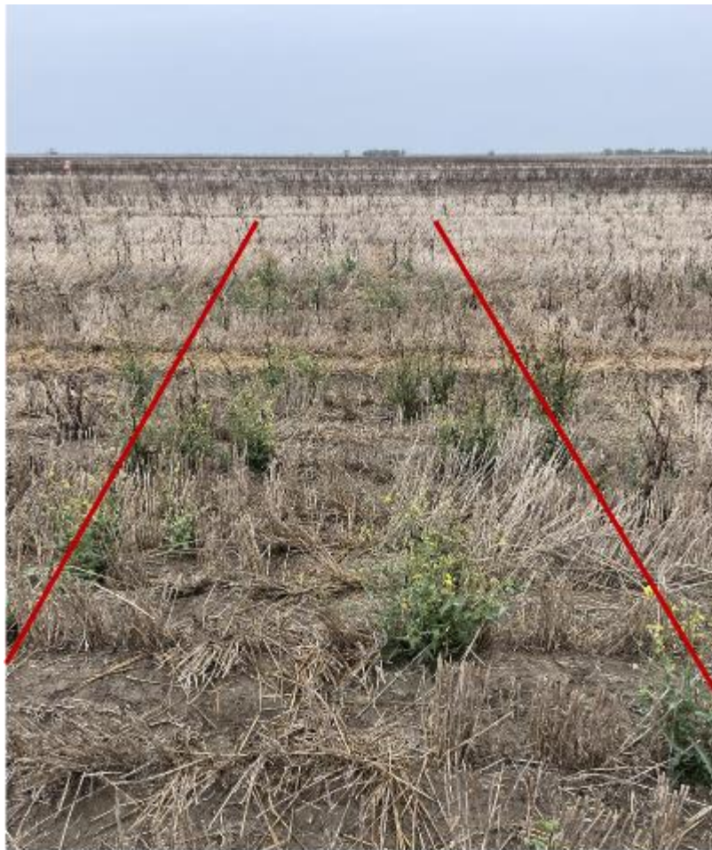
2.75 L Crucial