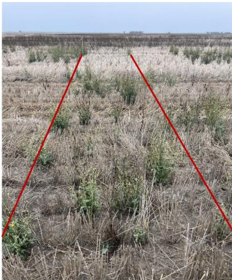
2.1 L Roundup PL (Delta T 11.2)