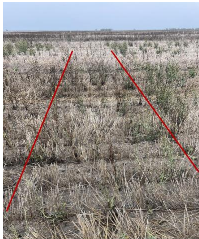
1.17 L XtendiMax2