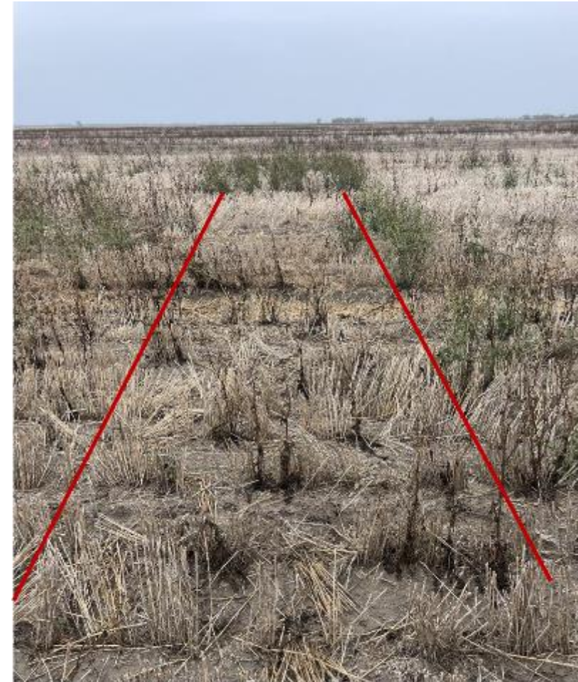
5.5 L Crucial (Delta T 6.7)