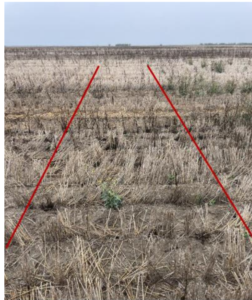
4.8 L Amicide Advance 700