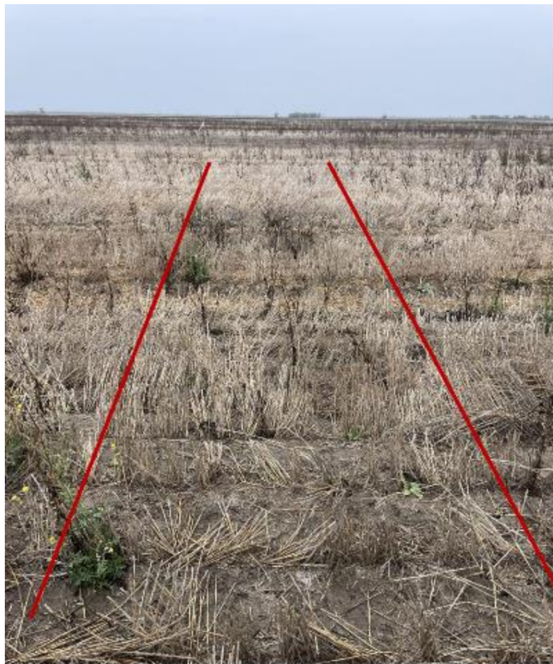
5.6 L Guerrilla