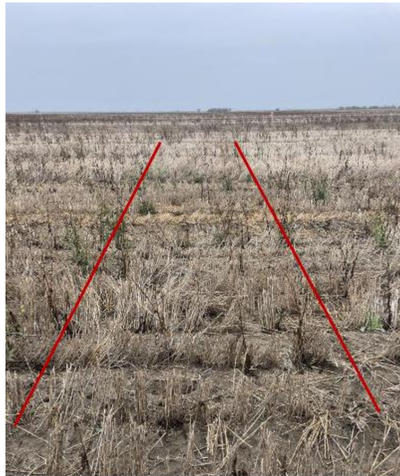
5.5 L Crucial